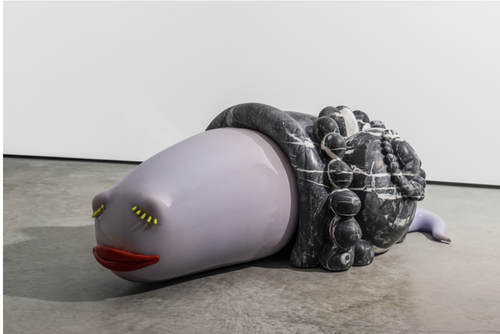
Meryl Sleep, 2023, hand-carved Pele de Tigre, blown glass.

MORE: Explore the Blanton Museum's Spectacular New Outdoor Art Space