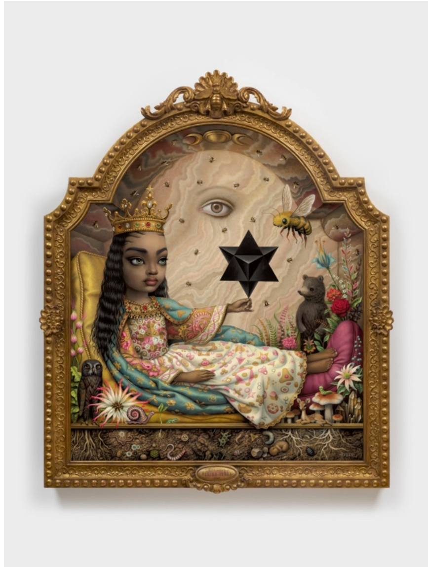
Regina Terra (#179), 2024