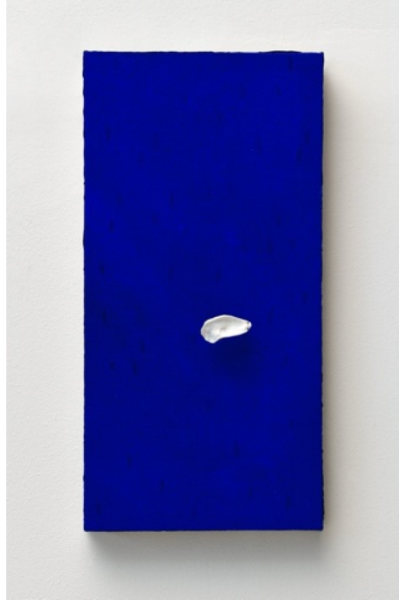
Pier Paolo Calzolari - Untitled.